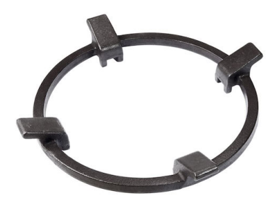
Cast iron wok support 9601 727